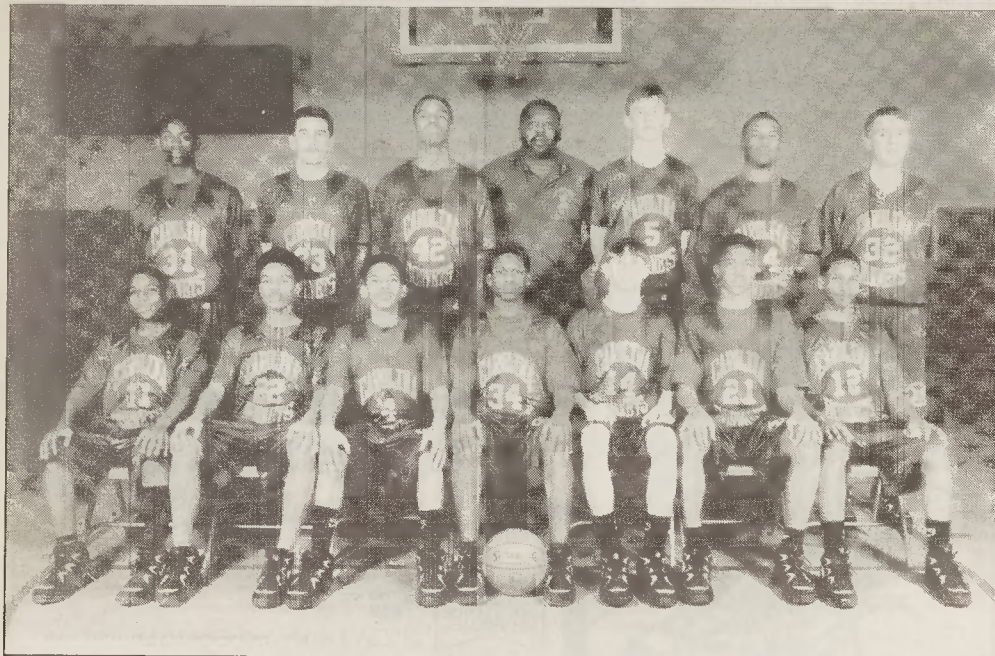
Carolina Hornets 14-and-under AAU basketball team