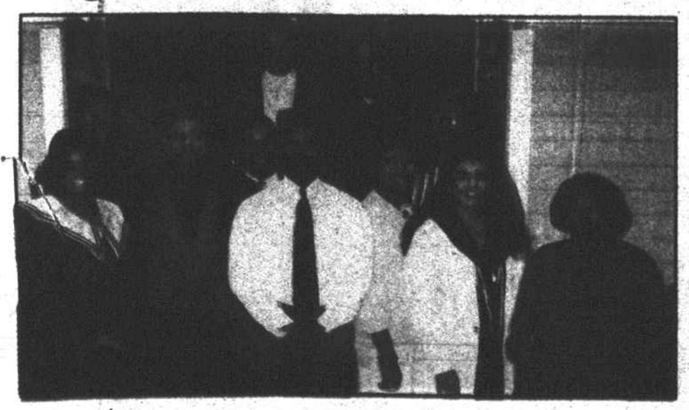
Members of the African-American task force were successful in their recruitment drive for additional Big Brothers/Big Sisters volunteers.

By VERONICA CLEMONS Chronicle Staff Writer