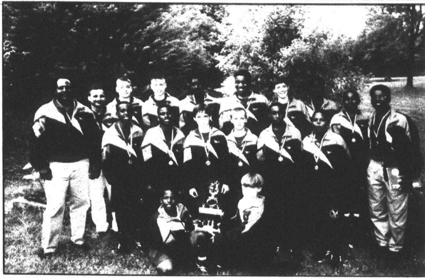
12-and-under Carolina Hornets