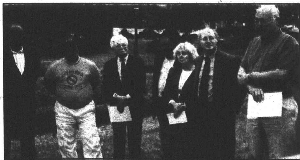
Local citizens gathered in Grace Park to promote Non-Violence Day in Winston-Salem.