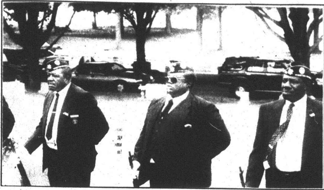
Local veterans gathered at Evergreen Cemetery on Memorial Day to commemorate their comrades who have died. A wreath was placed on the grave of a World War I soldier and a 21-gun salute was fired to honor the men and women who gave their lives for the nation.