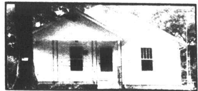
4008 LEO STREET Wood Frame construction. Contains kitchen, living room, 2 bedrooms and bath. $25,000

For additional information or site visitation, call the Real Estate Office at (910) 727-8484 during normal business hours. CITY OF WINSTON-SALEM REAL ESTATE OFFICE 225 WEST FIFTH STREET, SUITE 310 WINSTON-SALEM, N.C. (910)727-8484