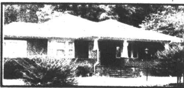
2920 NORTH PATTERSON AVENUE Brick veneer house with garage. Contains kitchen, living room, dining room, 4 bedrooms, and bath. $52,000

The City of Winston-Salem offers the following houses for sale.