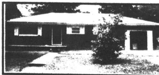
921 WENDELL STREET Brick veneer construction. Contains kitchen, living room, 3 bedrooms, den and 1-1/2 baths. Central air. $43,000