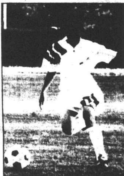
G lenn squared off with Parkland in junior varsity soccer Oct. 18 at Parkland. The host Mustangs came away with a 2-0 shut out.