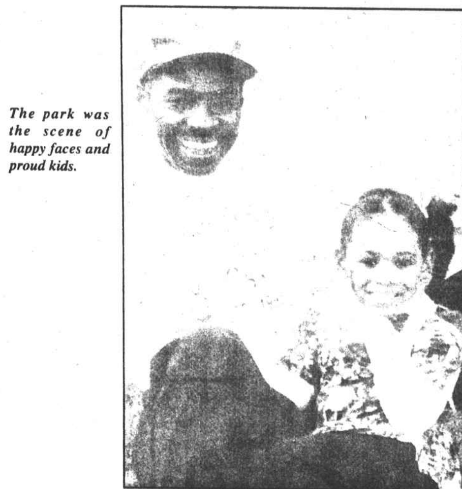
The park was the scene of happy faces and proud kids.