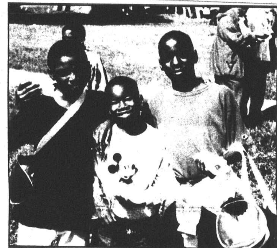
Children received food, drinks and free school supplies including book bags, paper, pencils, and toys.