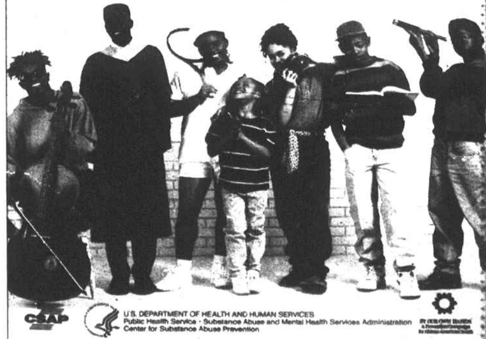
U.S. DEPARTMENT OF HEALTH AND HUMAN SERVICES Public Health Service - Substance Abuse and Mental Health Services Administration Center for Substance Abuse Prevention

BRENNAN'S BRIDAL & Tuxedos 659-1233 No One Beats our Prices! 1606 S. Stratford Rd. (next to Putt-Putt) M-F 10-6 • Sat 10-4