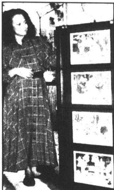
This window sash houses original posters from old "colored" movie houses advertising the movie "One Round Jones," starring Eddie Green.