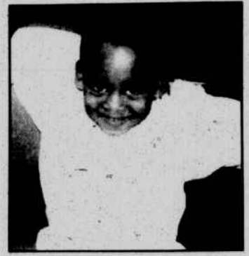
One happy pilgrim