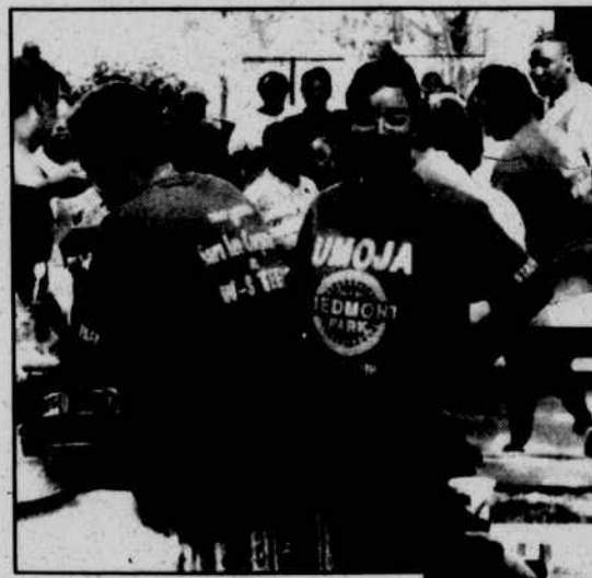
Umoja Day at Piedmont Park