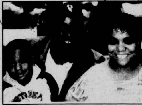
A family in Happy Hill Gardens enjoys a Thanksgiving feast sponsored by Community Outreach.