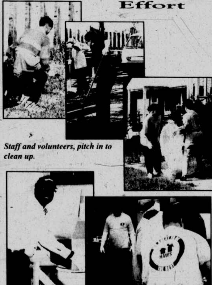
Staff and volunteers, pitch in to clean up.