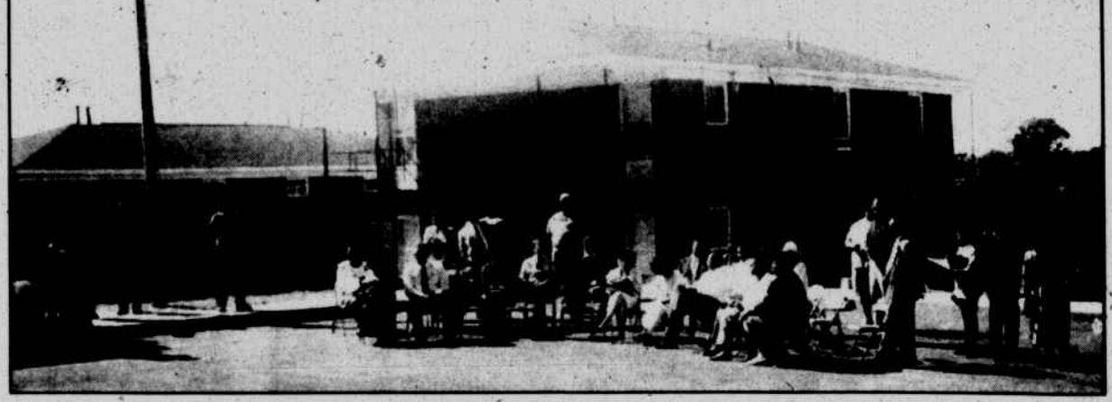
Renovations at Main Street were celebrated recently. The community has been renamed Pinnacle Place.