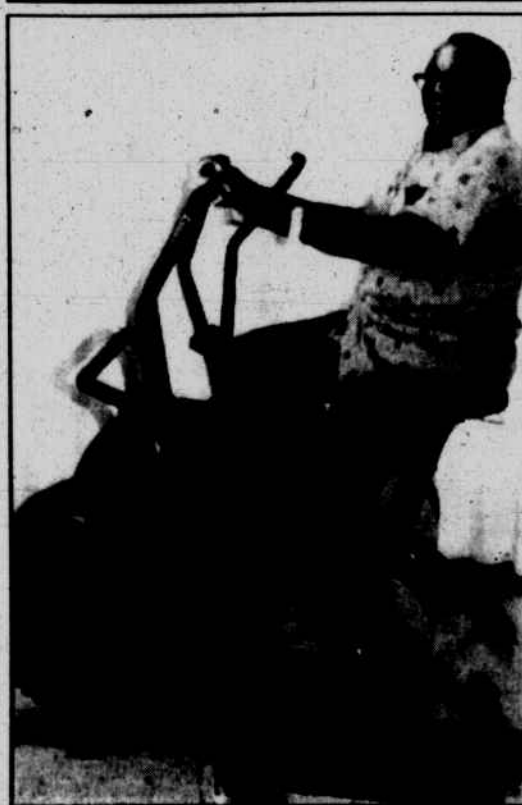
Sunrise Towers receives new exercise equipment.