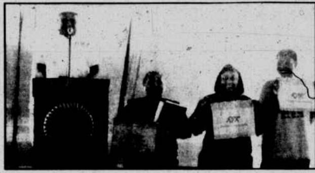
The staff of the RJR-HAWS Tutorial Program makes a presentation.