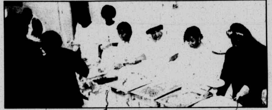
Friendship, fun, fellowship!