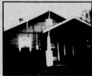
819 Akron Drive