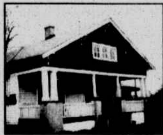
829 Akron Drive

These two 1920's era cottages are to be torn down to make way for new development. Approx. 1200 square feet each. Charming details, irreplaceable materials. Houses will be given at no cost to any party interested in moving them to another location. Deadline for inquiries is March 2, 1997.