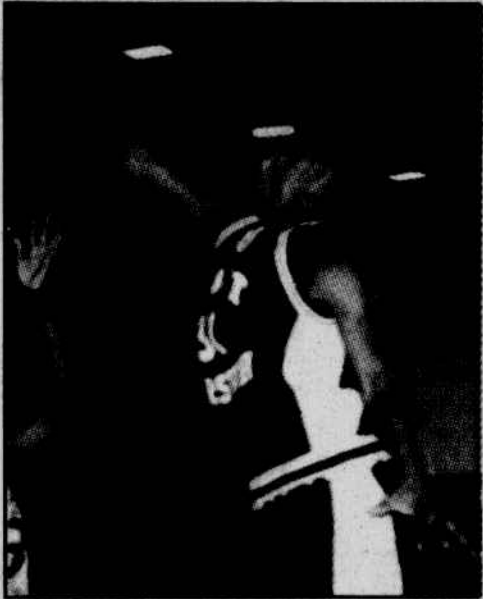
Tyree Manns 6-7 Junior East Forsyth