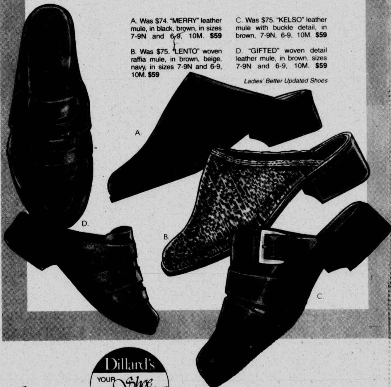
A. Was $74. "MERRY" leather mule, in black, brown, in sizes 7-9N and 6-9, 10M. $59