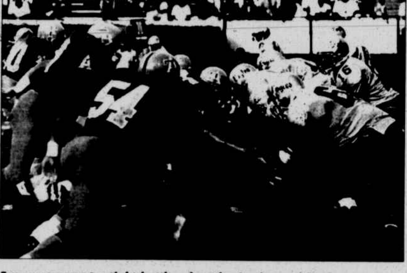
Fans can expect a tight battle when the Aggles and Eagles square off on Saturday at Carter-Finley Stadium in Raleigh.

University will hold it's annual Chancellor Scholarship Reception from 6 p.m. to 9 p.m. at the Tickets are $15. For more infor-