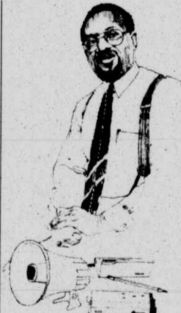
Al Cloud Owner Red Alert Security Charlotte