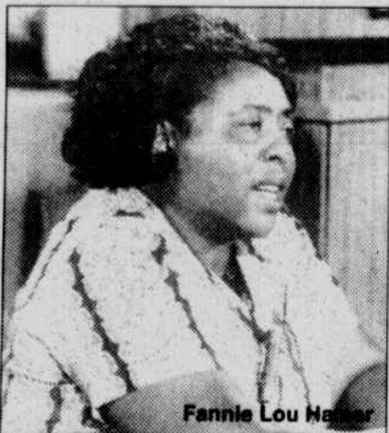
Fannie Lou Hamer

On Nov. 6, 1990, Sharon Pratt Dixon (Kelly) became the first woman mayor of Washington, D.C., and the first black woman mayor of a major U.S. city.