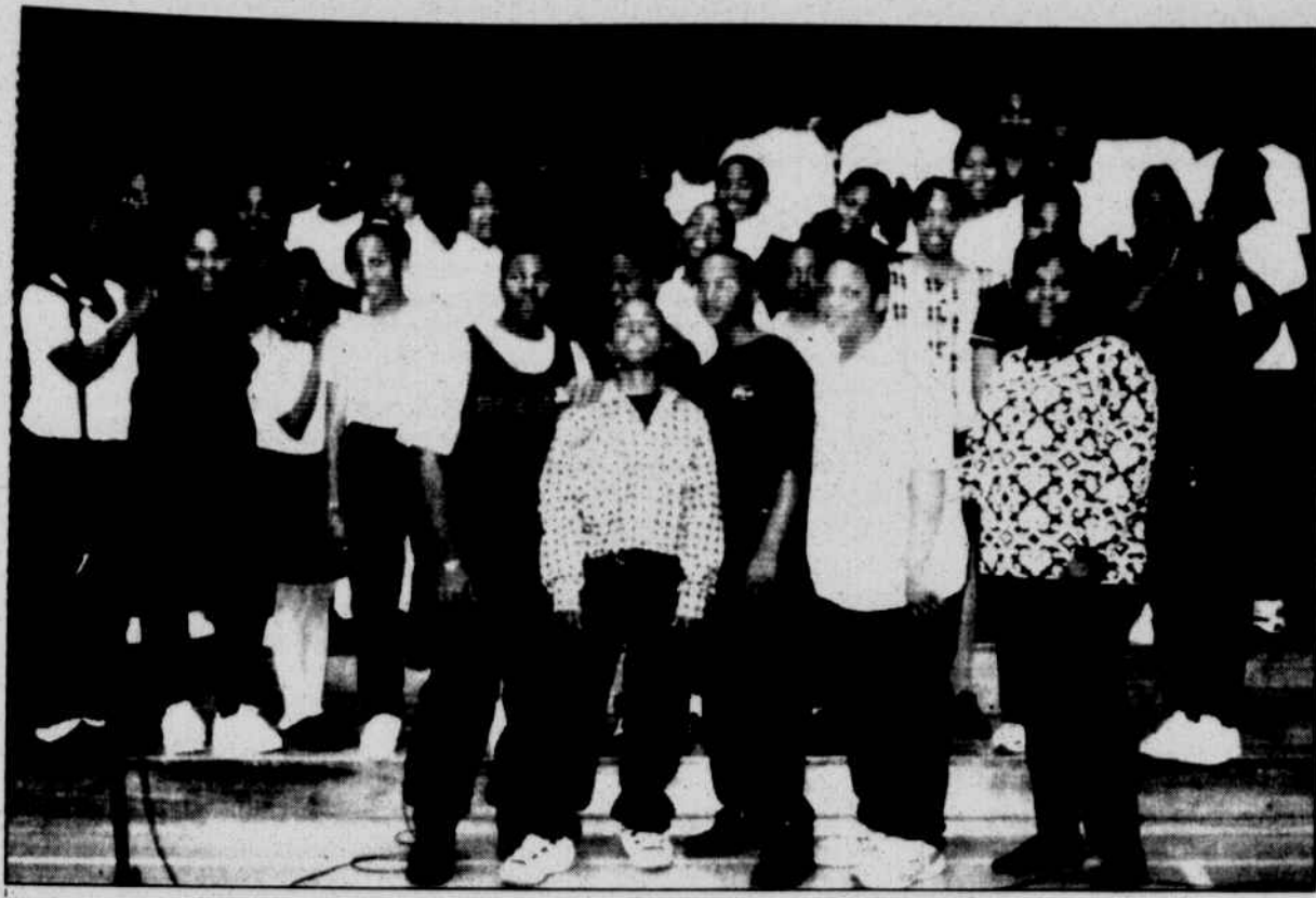
Voices of Victory is a gospel choir that began at Philo Middle School when four young men got together for a talent show at Philo.