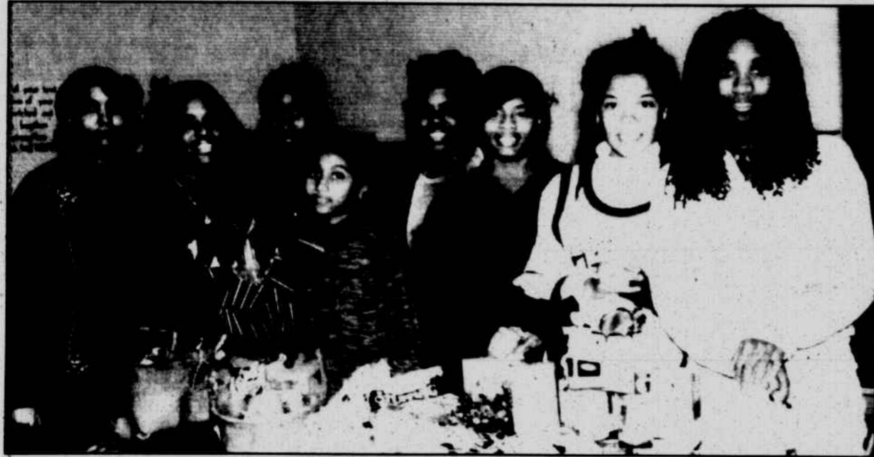
Pfafftown Youth Achievers show their pleasure with the Thanksgiving box items.