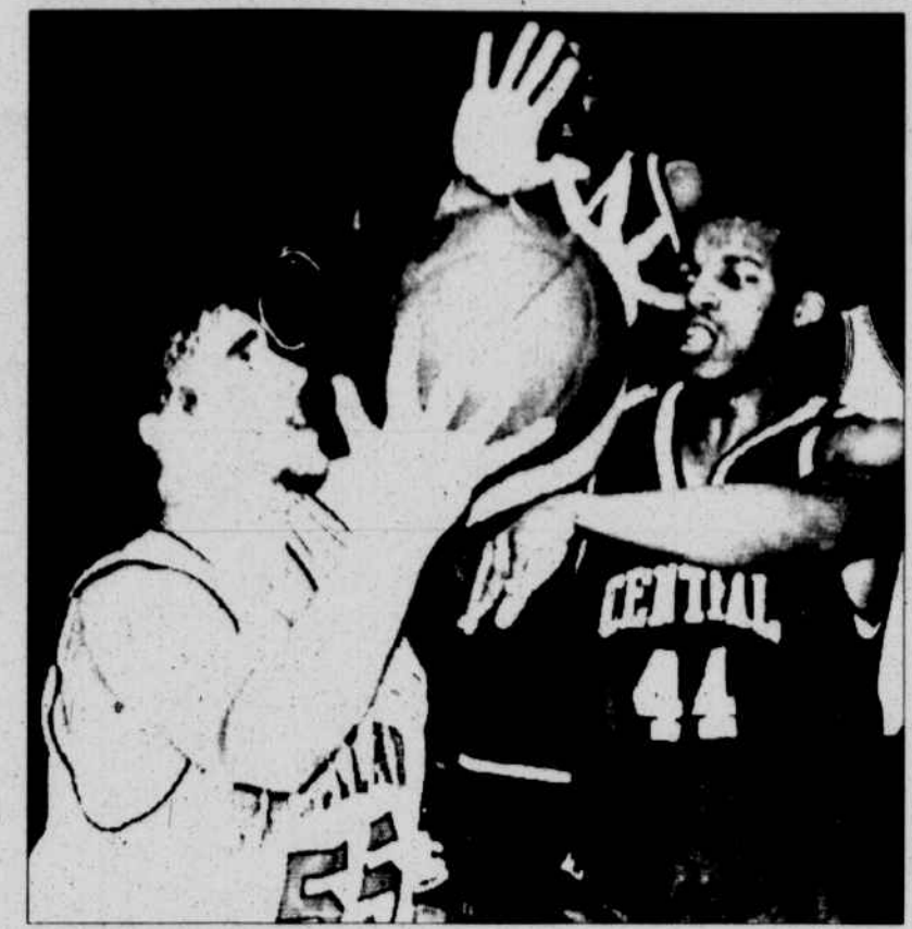
High Point Central's defense helps to get its fastbreak offense in gear. The Bison moved down a classification and will be among the league favorites this season.