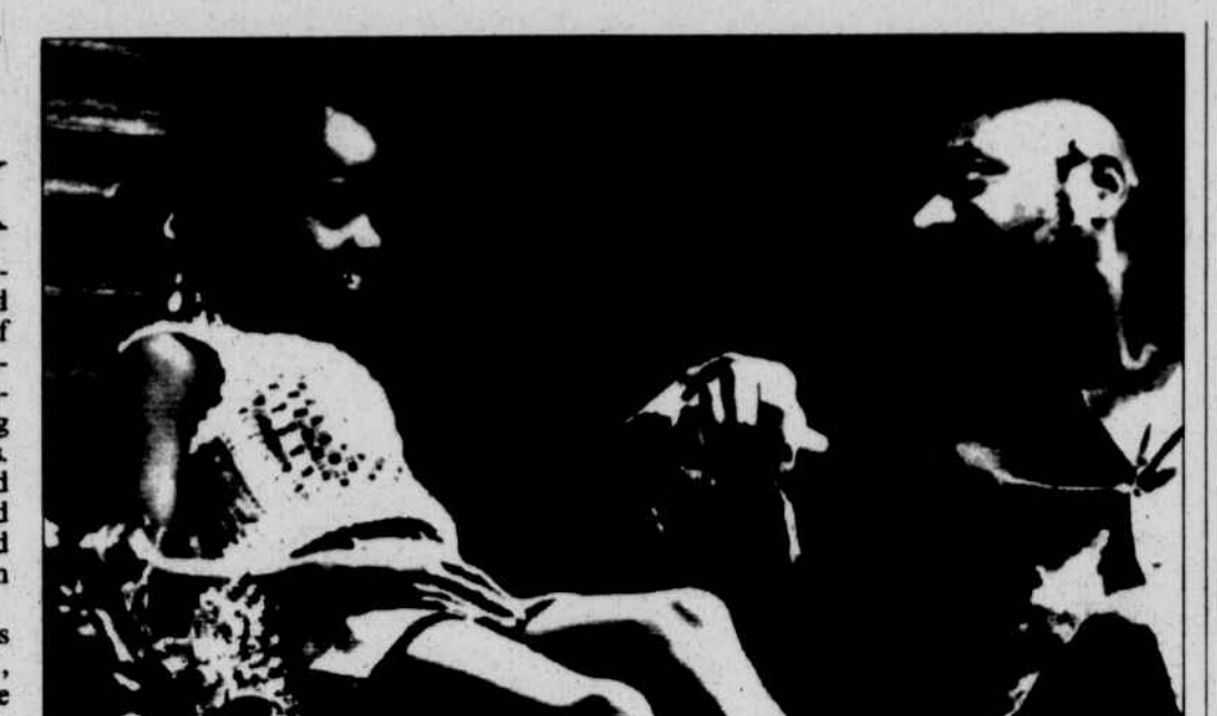
The African Heritage Network (AHN), hosted by Ossie Davis and Ruby Dee, presents a special prime-time presentation and broadcast premier of Creeklyn, Sp trayal of a loving family struggling to make it in the 1970s. ike Lee's por

"As a film maker, and more importantly as a black filmmaker, I think it's important to expand the subject matter of the films we