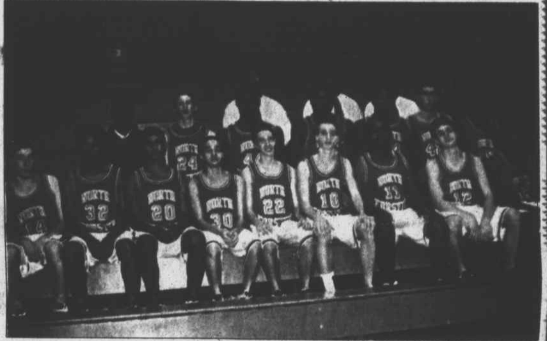
See North Forsyth on B6 North Forsyth Junior Varsity (see rosters on page B5)