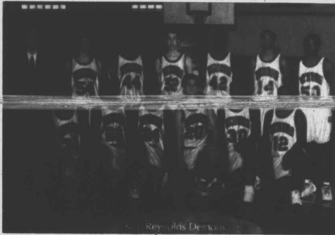
Reynolds Junior Varsity (see rosters on page B5)