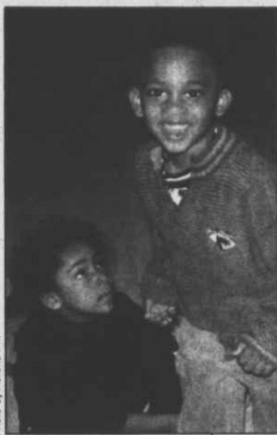
Two youngsters enjoy themselves at a Valentine's Day gathering at the 14th Street Community Center.

On Valentine's Day, the 14th Street Community Center threw a party. But it wasn't an ordinary Valentine's Day jam.