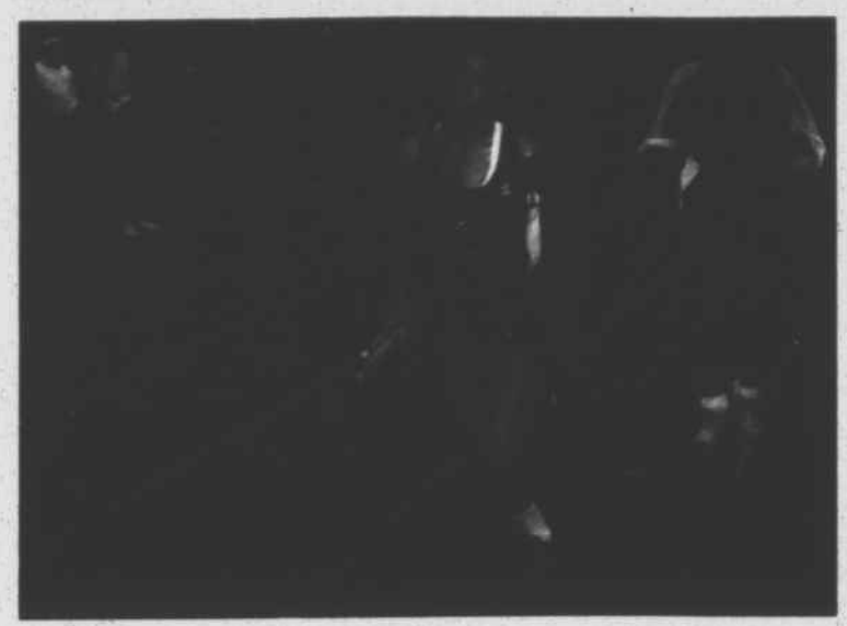
Junior Rosheta Webster not only runs the 4X400, but she also competes in several field events.