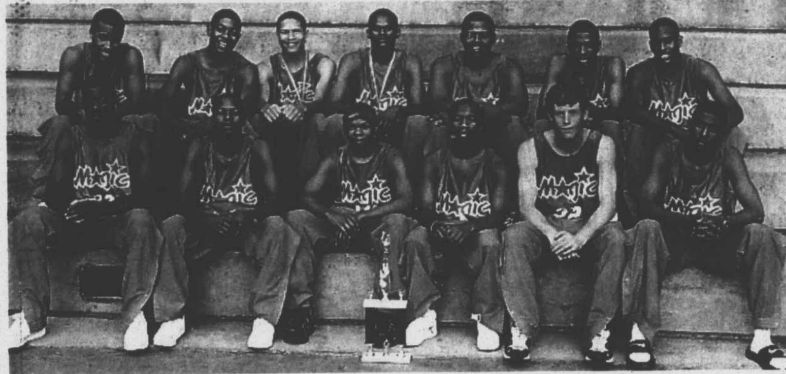
Kappa Magic won the State 16-and-under Boys title last year. Most of the team moved up to Jr. Boys competition this year.