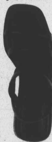
NINE WEST $49

"Biscayne" With sueded lining, buckle closure, white, adobe, 6-10M.