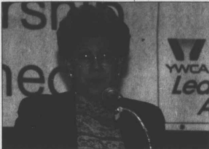
Dr. Antonia Novello

"There are entire families at risk and we are missing the window of opportunity to make an