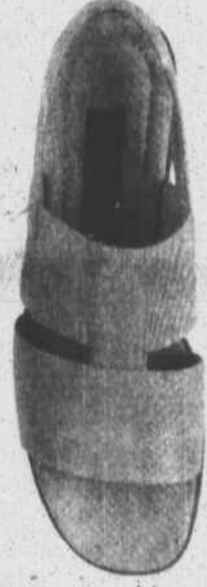
EASY SPIRIT $39

"Mango" Black, turquoise, gold, white, 5 1/2-10M, 7-9N.