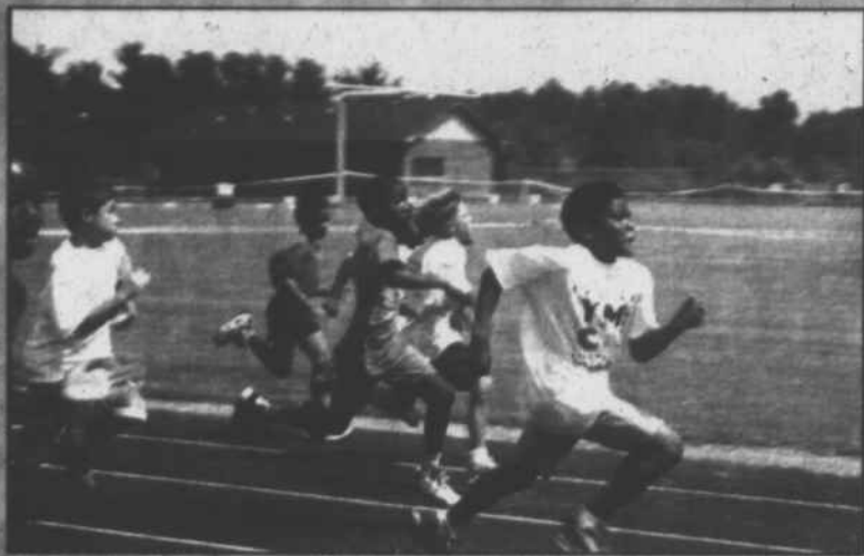
Some 400 children participated in the Character Development Games, sponsored by the YMCA of Winston-Salem, at North Forsyth last Friday.