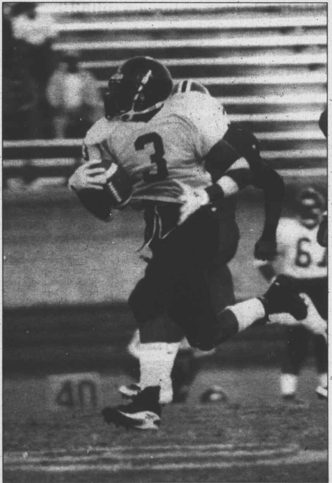
Livingstone's ground game had accounted for nearly 300 yards per game, but was quiet against Tuskegee.