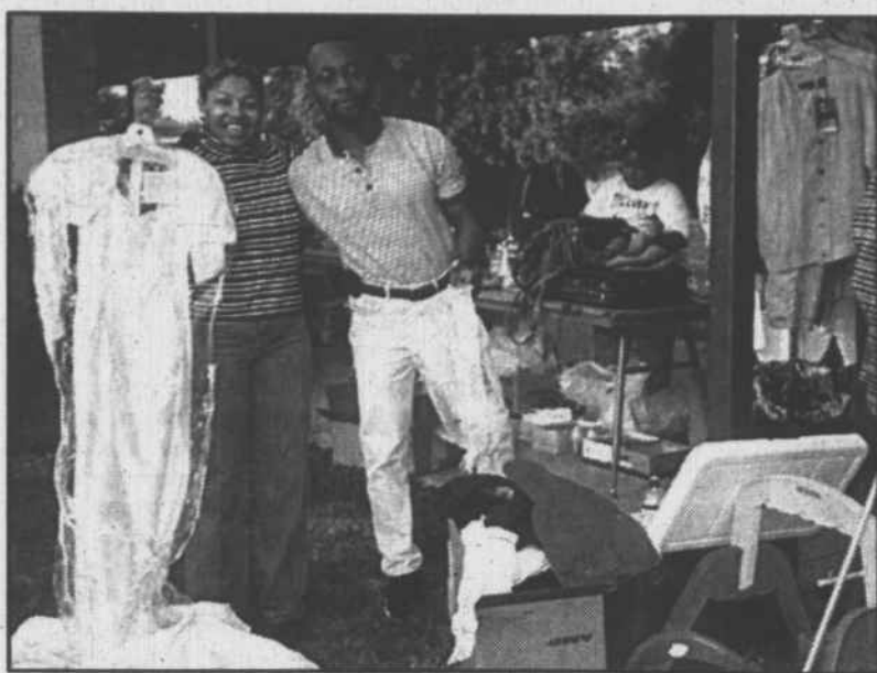
A family shows off a gown during Easton's yard sale.

For Grandparents' Day, students submitted essays about "Why