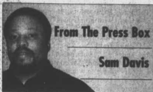
From The Press Box