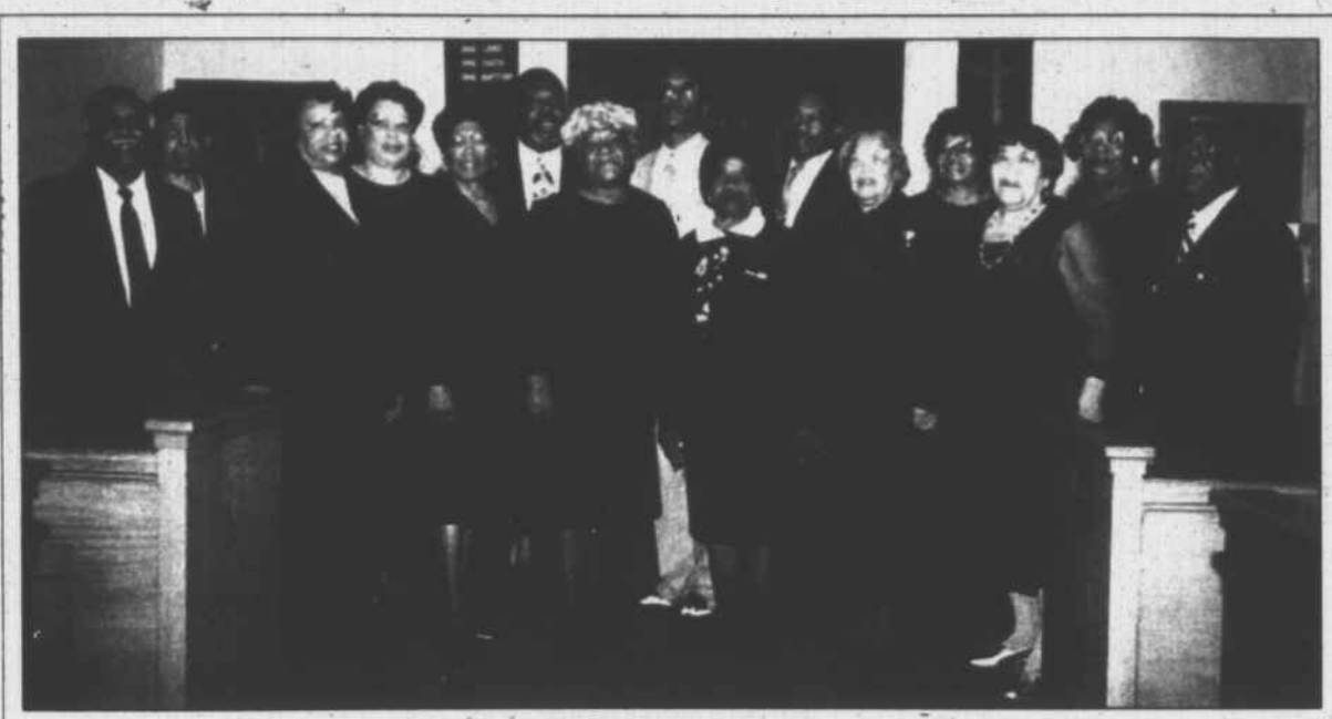
Camp Meeting Choir