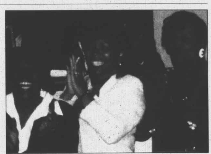
The mothers of the Carver football players treated the audience to a rendering of the Yellowjackets' pre-game song "Mama, Mama, can't you see what the Lord has done for me?"