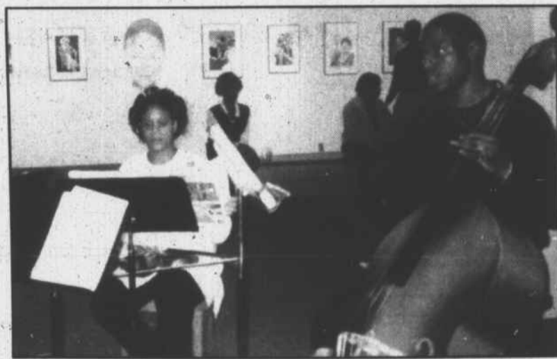
WSSU String Ensemble at opening reception of Young People's Art Exhibit at Diggs Gallery April 16.

The Young People's Exhibit is a project of the Winston-Salem Chapter of The Links Inc. and is a special event of the Arts Facet. Collaboration with Diggs Gallery and Winston-Salem/Forsyth County Schools provides students, kindergarten through 12th grade, the opportunity to have their art hung in a real gallery and to experience the excitement and pride of a true opening, with the exhibit extending for three weeks. This event brings parents and friends of the exhibitors to the gallery to view the excellent works of students from the university and the Winston-Salem/Forsyth County School System.