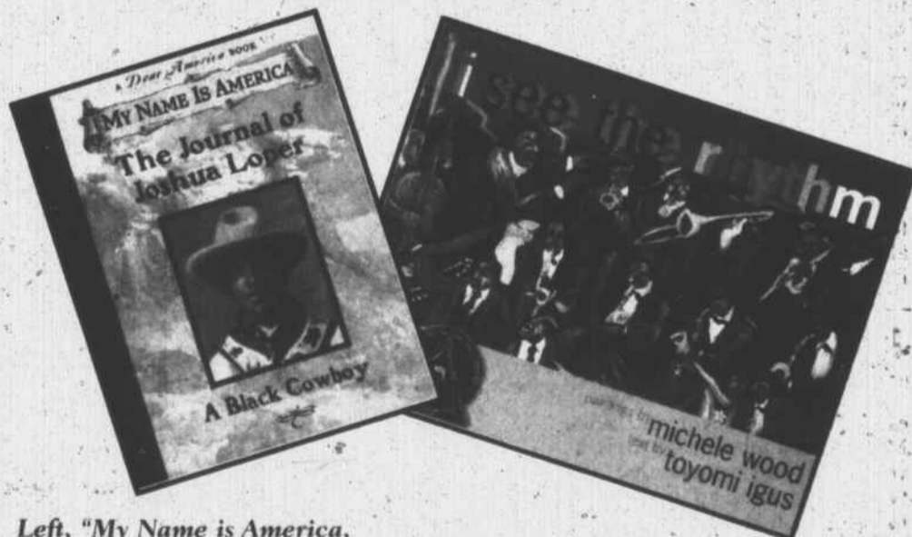
Left, "My Name is America, The Journal of Joshua Loper, A Black Cowboy " By: Walter Dean Myers