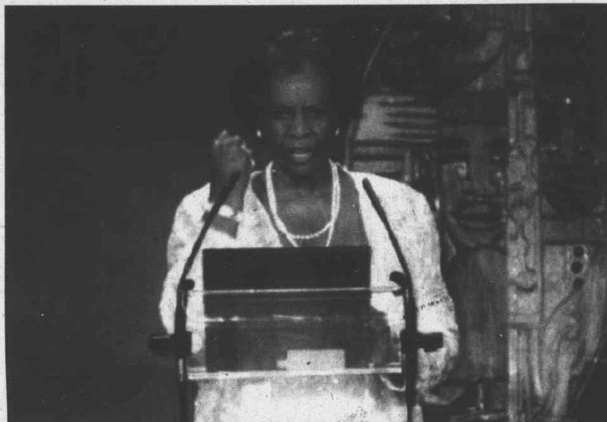
Actress Virginia Capers recites a Langston Hughes poem.