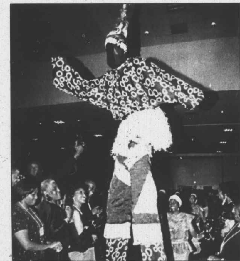
A masked dancer led a procession that included actors and festival organizers.