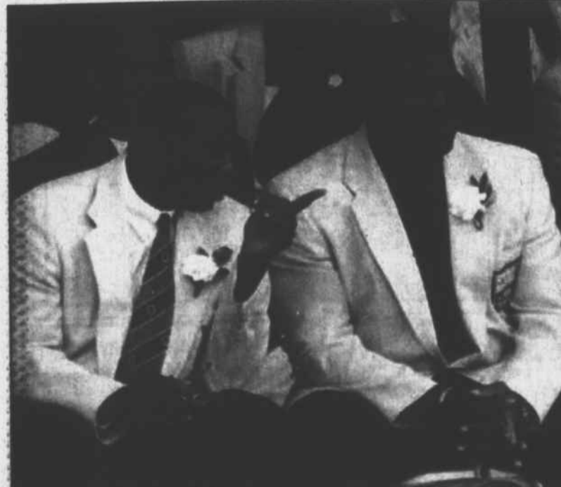
Hall of Fame inductees Lawrence Taylor (right) and Ozzie Newsome.

school football player. He has seen firsthand what his brother had to endure and has chosen to sidestep it completely. That in itself is a sign of his maturity and ability to make good decisions.