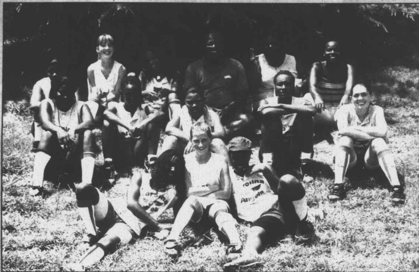
Members of the Carolina Angels softball team show off their game at last week's tournament held in Rupert Bell Park.