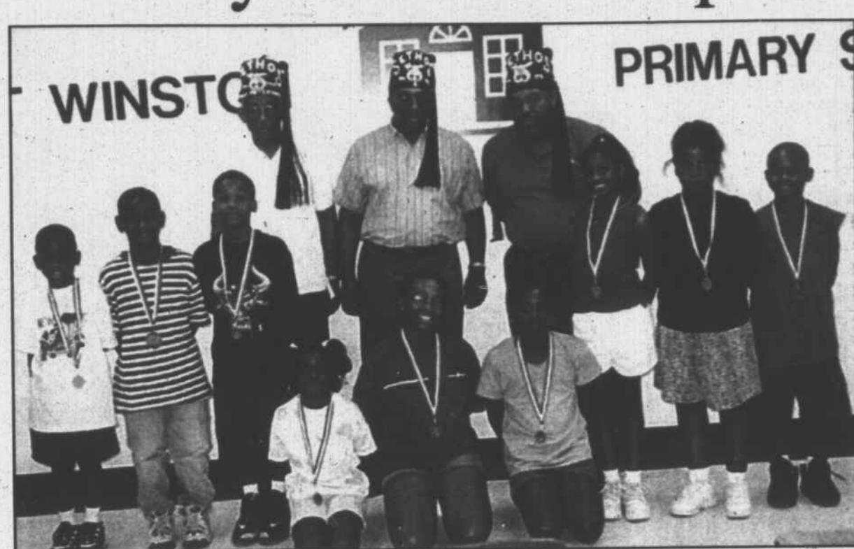
Nine children received medals from officials of Sethos Temple No. 170.