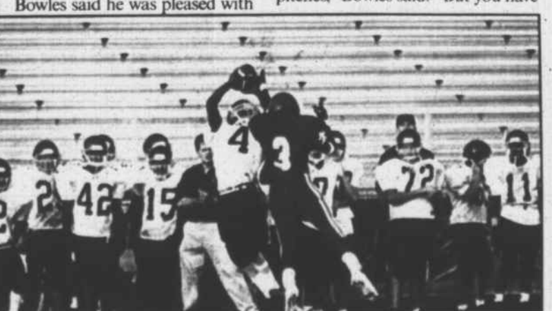
Mount Tabor had the upper hand early, but North fought back to tie the game.