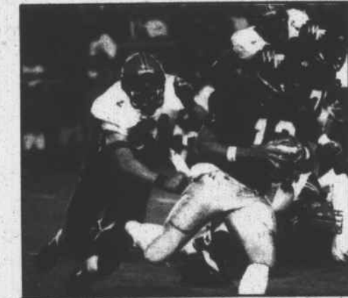
Ben Sankey runs for yardage on the option.