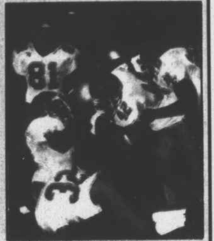
North's defense converges on a Reynolds runner.