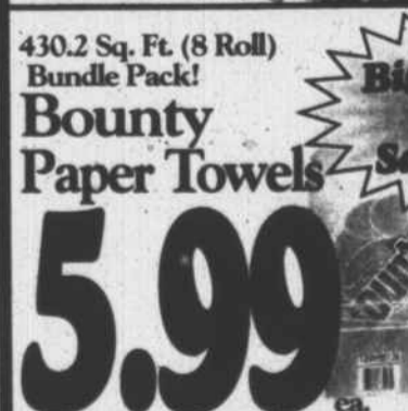
430.2 Sq. Ft. (8 Roll) Bounty Paper Towels 5.99