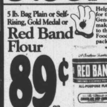
5 lb. Bag Plain or Self-Rising, Gold Medal or Red Band Flour 89¢