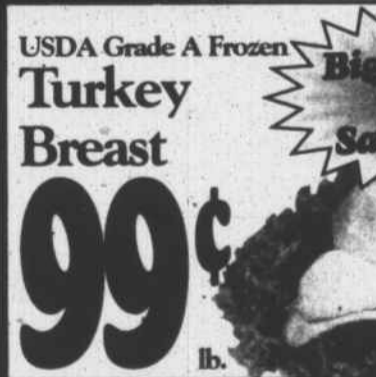
USDA Grade A Frozen Turkey Breast 99¢ lb.

At Lowes Foods, it's always fresh, or we replace the item and refund your money!