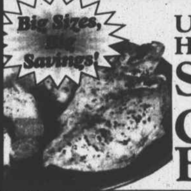
Big Sizes, Big Savings!

USDA Fresh Jumbo Pack House of Raeford Split Chicken Breast 99¢ lb.