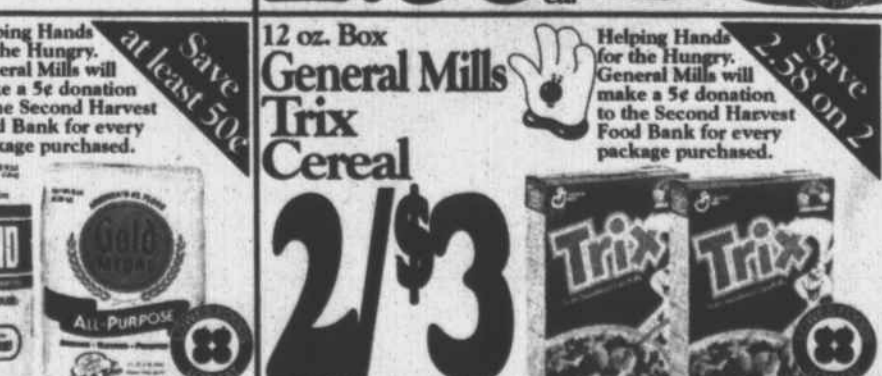
12 oz. Box General Mills Trix Cereal 2/$3