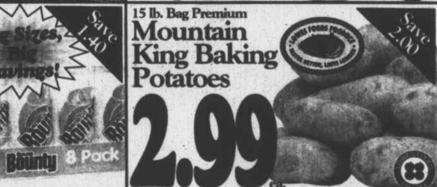
15 lb. Bag Premium Mountain King Baking Potatoes 2.99