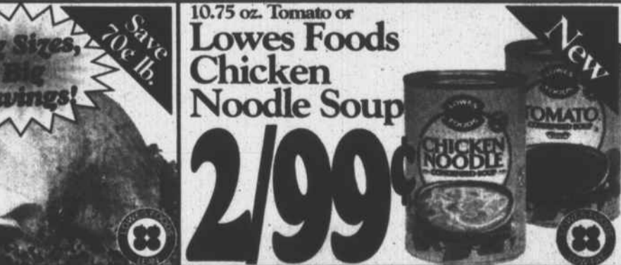
10.75 oz. Tomato or Lowes Foods Chicken Noodle Soup 2/99