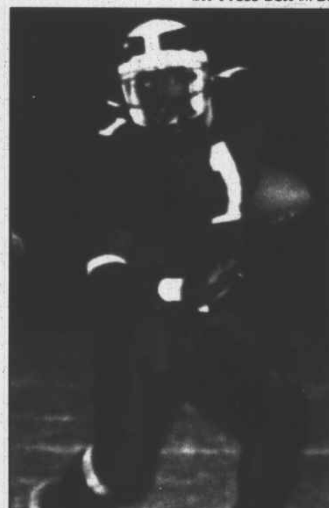
New attendance, GPA standards could significantly impact African Americans.