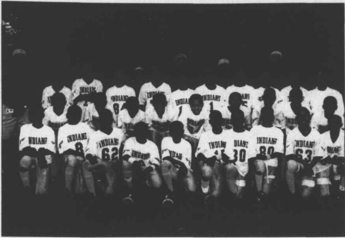
The Tiny Indians' Pee Wees advanced to the regional playoffs after capturing the NWAFL championship with a win over the Falcons.