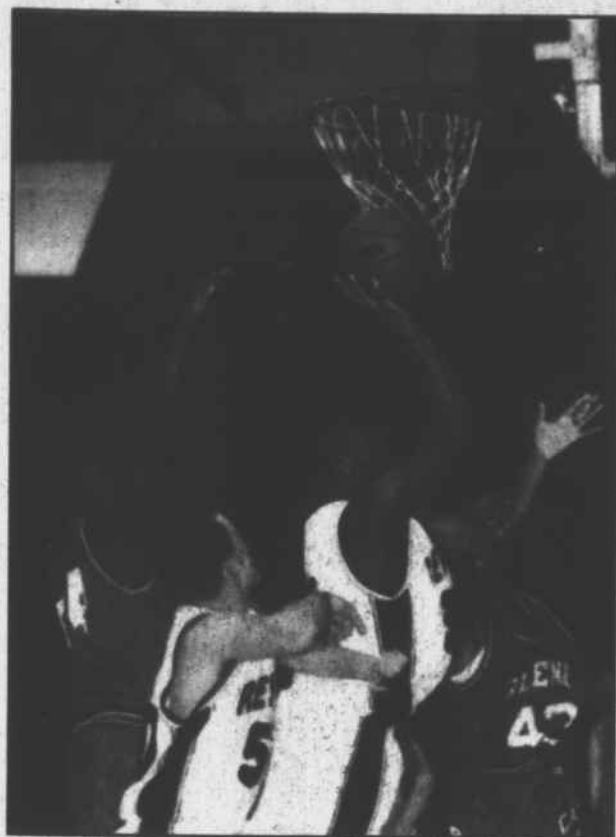
Omar Byrom's inside power was too much for Glenn in a semifinal win.