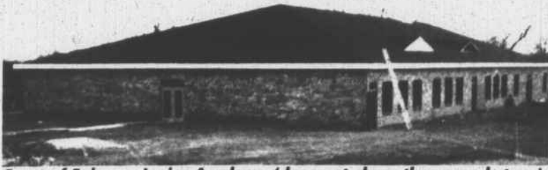
Front of Ephesus Junior Academy (does not show the second story)