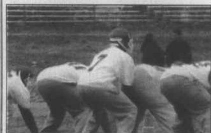
St. Augustine's College looked like the days of old as football practice got under way after a 35-year hiatus. The Falcons, who will play a regular fall schedule, will take on Fayetteville State in their first game of the season.

Football is officially back at St. Aug's and Shaw