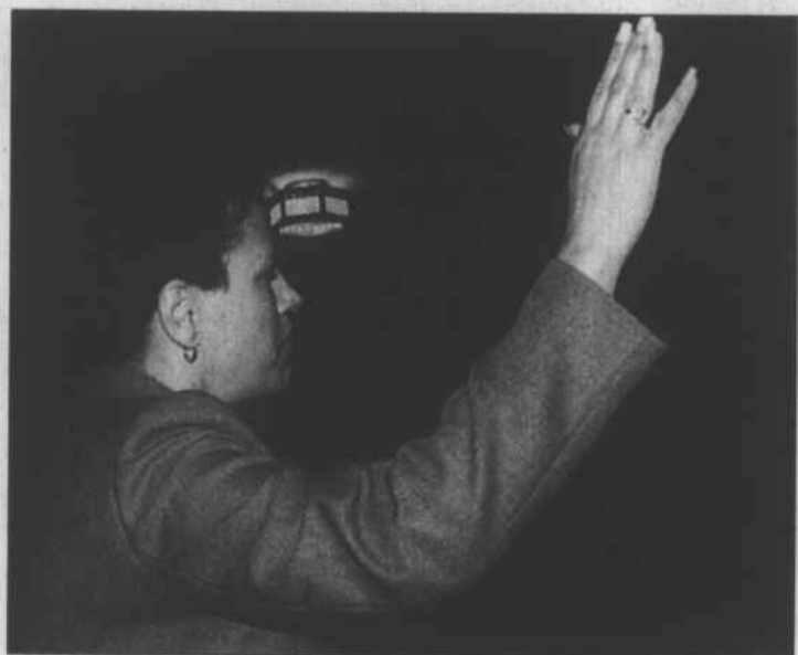
A member of the audience raises her hand to praise God.