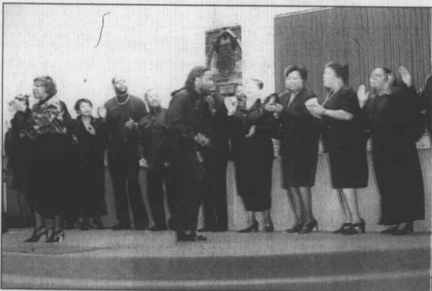
St. Stephens Missionary Baptist Church's Combination Chorale