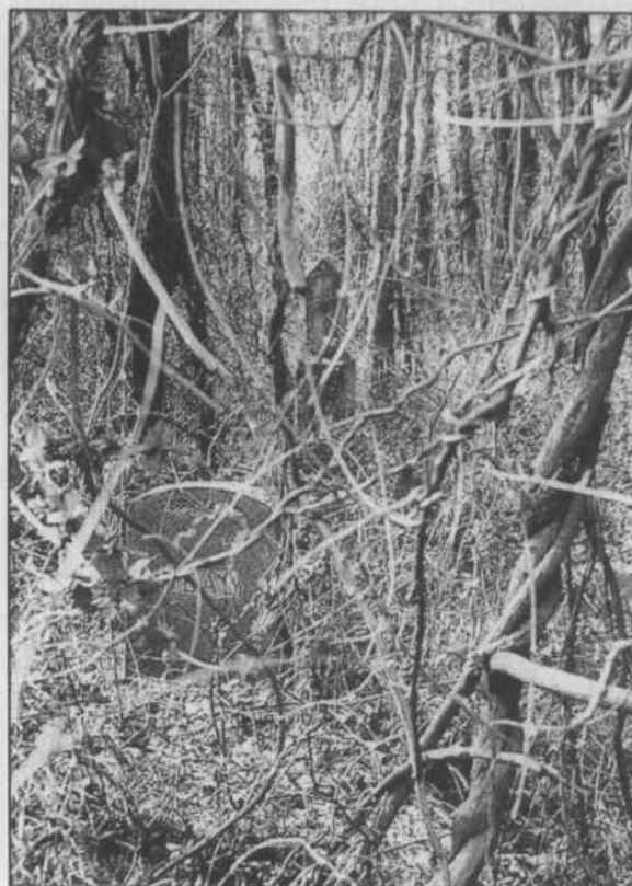
Efforts to improve conditions at Odd Fellows Cemetery have been ongoing for the past several years. Here a headstone is nearly invisible because of shrubs and vines.