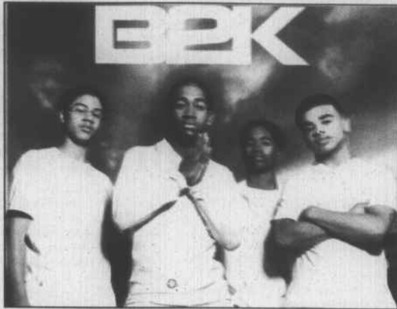
Hot new boy group B2K shocked the music industry last week when its debut CD entered the Billboard Hot 200 Album Chart at number 2. The disc sold a little more than 100,000 copies in its first week of release.