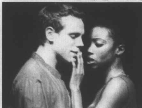
Heather Headley in "Aida"

Having displayed awesome chops on both her Tony and Drama Desk Award winning turn in Elton John and Tim Rice's Broadway smash, "Aida" (where she originated the title role of a captive