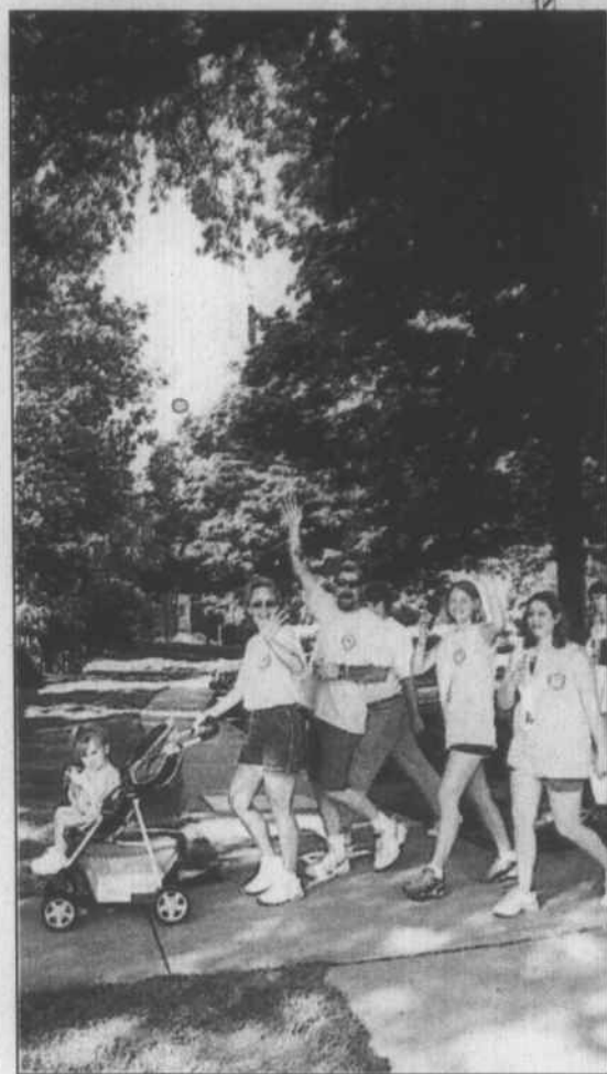
Forsyth Technical Community College WalkAmerica team walk by Wait Chapel for 2001 WalkAmerica.

national voluntary health agency whose mission is to improve the health of babies by preventing birth defects and infant mortality. Founded in 1938, the March of Dimes funds programs of research, community services, education, and advocacy to save babies. More information is available on the March of Dimes Web sites at www.marchofdimes.com and www.nacersano.org